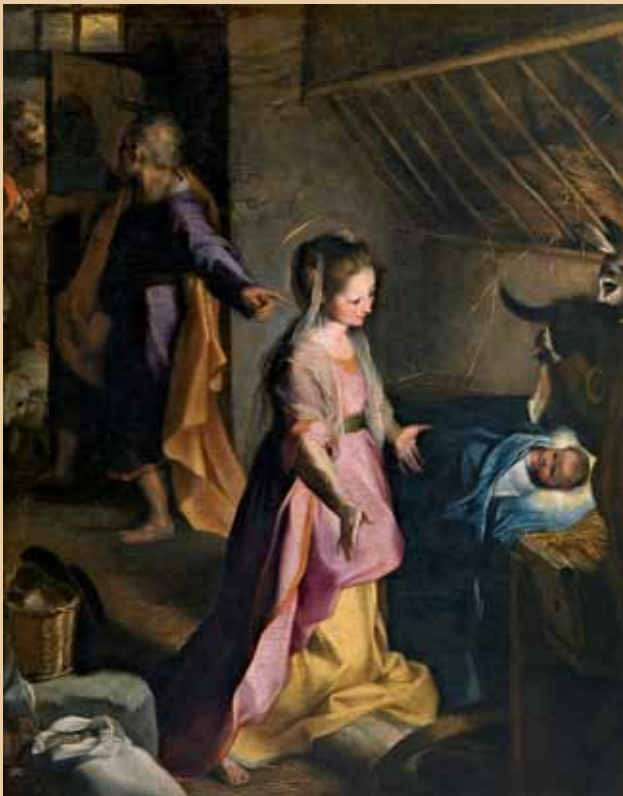
The Nativity, Federico Barrocci, Prado museum, Madrid

Love in that stable was born Into our hearts to flow; Innocent dreaming babe, Make me thy love to know.